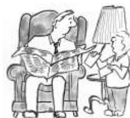
"Here's my report card and here's my personal disclaimer."

Cycle two reports will go out on the 1 st of August for Grade 1-7. A reminder that our school has a three-cycle reporting system, and reports go out on 1 May, 1 August and 1 December.