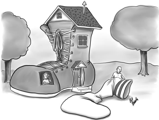
"He's outside setting up a tent for the kids."

We will remind you in next week's newsletter, but start hunting up those old sheets and brooms this week.