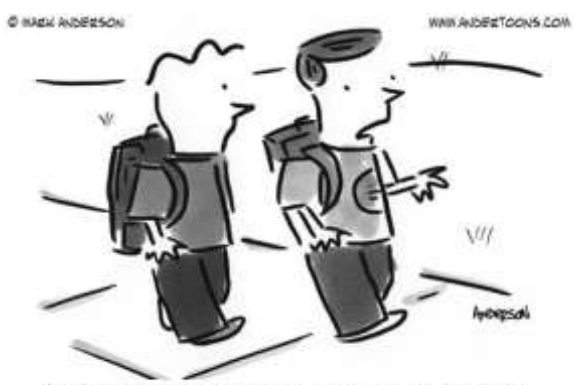
"I find if you rub sausage on your homework you greatly increase the odds of a dog eating it."

Website: http://nelmes.co.za neighbourhood lawyer.