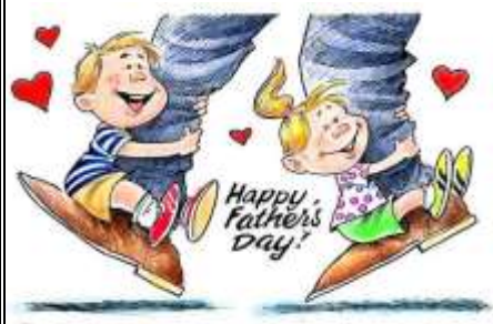
My GRANGED Www.thehappyfathersdaymenagez.com

If you are interested in this exclusive advertising offer, please either let the office know, or contact Red Apple directly <a href="mailto:admin@redapplepublishers.com">admin@redapplepublishers.com</a>.